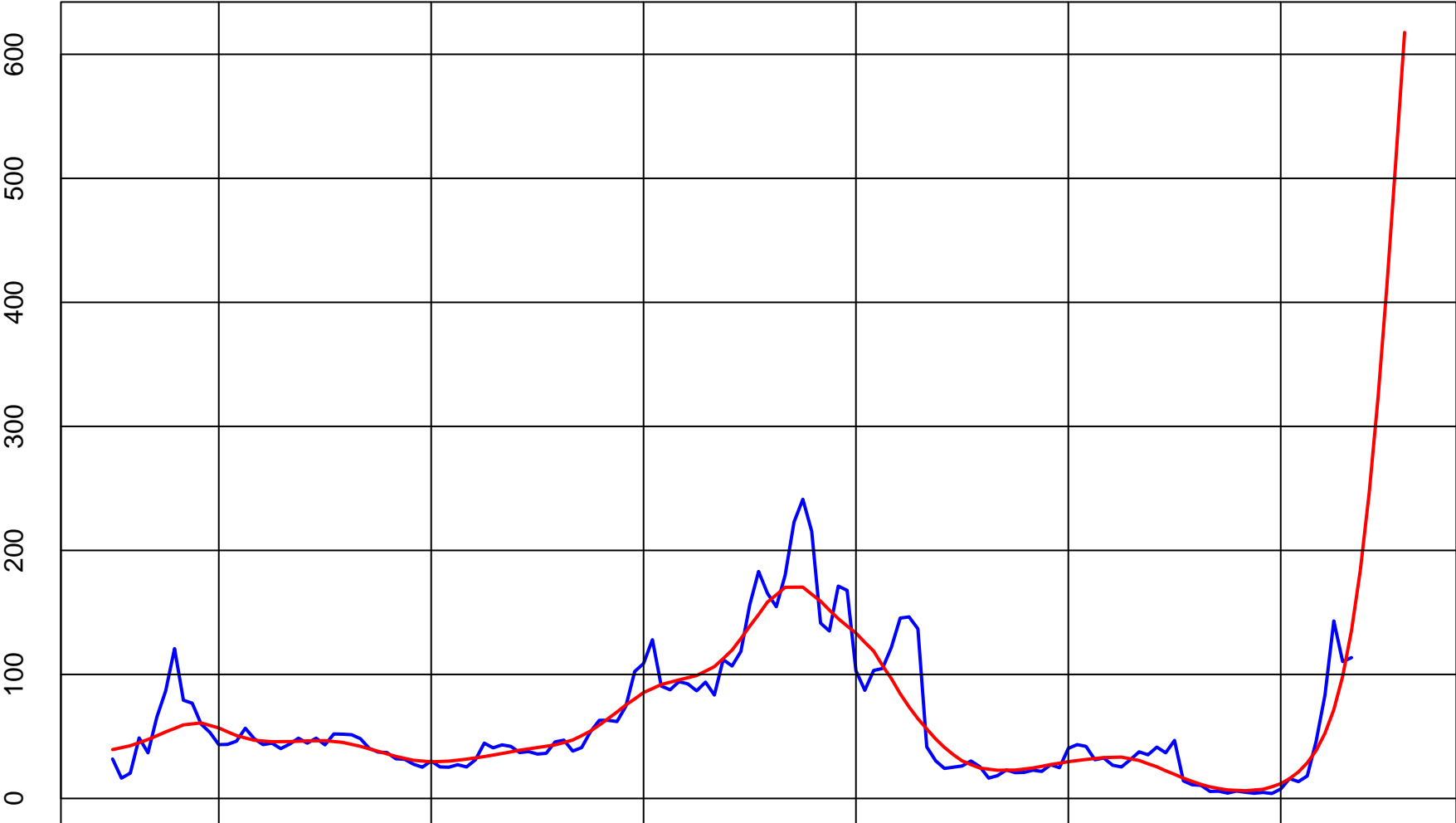
Price Series (Blue)